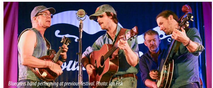
Bluegrass band performing at previous festival.

Morning: Enjoy an early morning coach tour to Harrietville, an alpine village at the foot of Mt Feathertop, in Victoria's High Country. Spectacular scenery on the 25 km drive from Bright to Harrietville. On our way back to Bright we will visit the excellent Nightingale Bros. fruit shed/shop, at Wandiligong. After returning to Bright you may like to attend the festival's mid-morning gospel concert. Afternoon: Enjoy the Mountaingrass Festival, including an afternoon concert. Evening: Enjoy the festival's final concert, featuring several of the festival's outstanding bluegrass and old time music acts. (B)