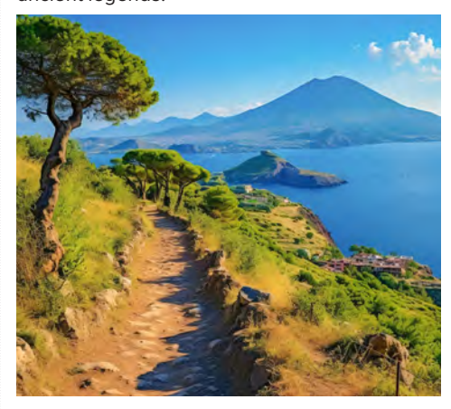
DAY 14 Monday, 5 October 2026

Lipari is not only the largest of the Aeolian Islands, but it is the least "volcanic" of its 7 islands, as evidenced by the weak hydrothermal and fumarole activity. Enjoy a free day to discover its charming village, reachable only by small ships like the Wind Surf, or delve into its mythological past. Lipari is steeped in legends, often linked to Greek mythology. It was believed to be home to the Cyclops in Homer's "Odyssey" and was associated with various ancient deities. Explore how these myths shaped the island's cultural and historical identity, celebrated as a UNESCO World Heritage site. Another option would be to take an excursion to the volcanic island of Stromboli, the source of many ancient legends.