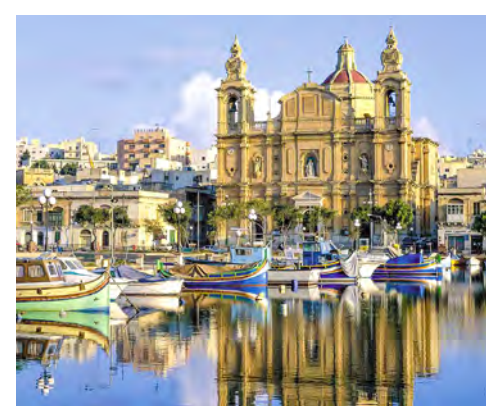
DAY 11 Friday, 2 October 2026 Porto Empedocle/Agrigento, Sicily, Italy

The capital of Malta, Valletta was founded by the Knights of St John in 1566. Its purpose was to strengthen the Order's position on the island, following the siege of Malta by the Turks in 1565. Enjoy a free day to explore, you may like to visit the St Johns Co Cathedral and the magnificent Palace of the Grand Masters. Another option is a tour to Mdina, Malta's ancient capital and a medieval walled town situated on a hill in the centre of the island.