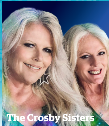
The Crosby Sisters