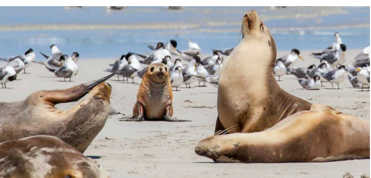
DAY 8 Sunday 5 October, 2025

Morning: Enjoy a journey on the historic Cockle Train, which travels between Victor Harbor and Goolwa. In early days of settlement, the local residents would take a horse drawn train from the Victor Harbor/Port Elliot area to Goolwa to collect cockles from the sandy beaches near the Murray mouth. It was a great day's outing, and thus the name...Cockle Train. We will spend some time in Goolwa, so you can explore this historic and picturesque river port town. We then travel across a bridge to Hindmarsh Island, where we see the Murray Mouth (where the Murray flows into the ocean). Late afternoon: Free time in Victor Harbor. Evening: A free evening for you to explore Victor Harbor. (B)