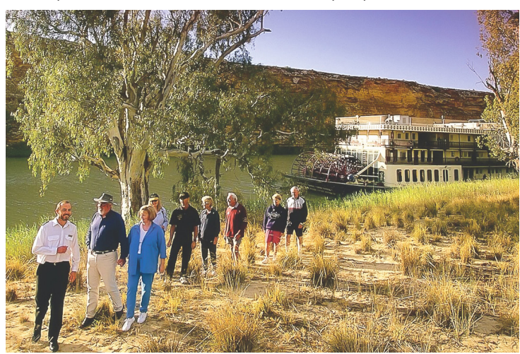
DAY 5 Thursday 2 October, 2025

After breakfast cruise to picturesque Swan Reach. The town was first settled in the 1850s and was originally the largest of five sheep and cattle stations in the area. The original Swan Reach homestead is now the Swan Reach Hotel, where you can enjoy an ale or cappuccino overlooking the Murray River. Visit the excellent Swan Reach Museum (optional...gold coin donation at entry), which includes singer Julie Anthony's debutante dress (she grew up near Swan Reach). Back on board, enjoy the tranquillity as the landscape slides by. When we arrive at Sunnydale, it's all ashore for the Woolshed Show, where we enjoy an entertaining sheep shearing demonstration. After the demonstration visit the Woolshed's Native Wildlife Shelter, where some of South Australia's native animals are cared for. Evening: For dinner, enjoy a great Aussie Barbecue - cooked and served in a bush setting on the banks of the mighty Murray River. After dinner there are two optional onshore tours to choose from (additional cost): (1) a Nocturnal Tour in a comfortable purposebuilt cart, where you may see kangaroos, wombats, foxes, bats and owls, & (2) the Dark Sky Night Tour, where you are taken to an internationally recognised Dark Sky Reserve to observe the stars of the Milky Way. (B,L,D)