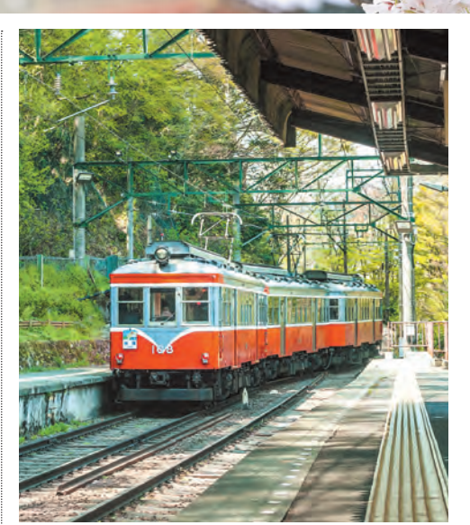
DAY 4 Friday 27 March 2026 Hakone – Mt Fuji – Tozan Mountain Railway

This morning, we'll see the volcanic geysers of the Owakudani Valley and enjoy spectacular views of Mt Fuji. Travel on the Hakone Ropeway to the peak of Mt Kamiyama, and continue on another cable car for a ride on the Tozan Mountain Railway. This 95-year-old train winds through a narrow, densely wooded valley past cherry trees and over many bridges and tunnels, stopping at small stations along the way. Arrive at the Hakone Open Air Museum for free time at lunch, and enjoy a boat ride on Lake Ashi for yet more views of Fuji. Return to your hotel for a free evening. Overnight: Hakone Kowakien Hotel, Hakone (B)