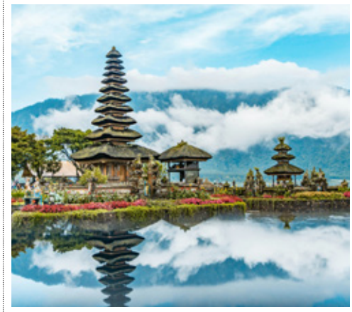
DAY 15 Thursday 25 June 2026 Ubud

Overnight: Arma Museum and Resort, Ubud (B,L)