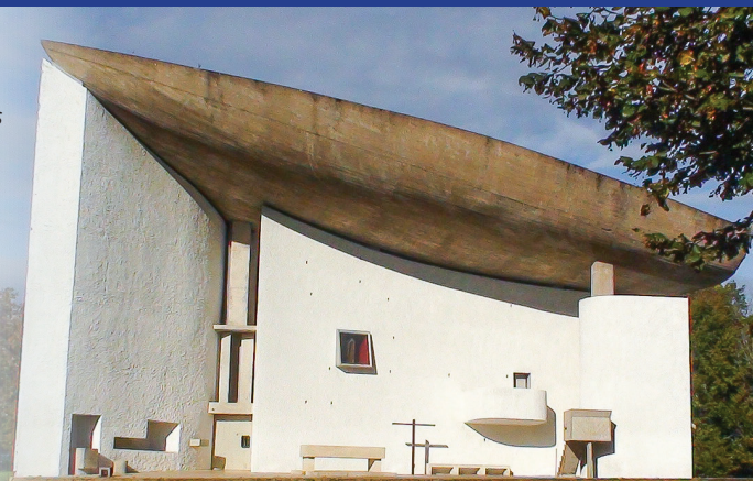
Ronchamp Chapel. Le Corbusier