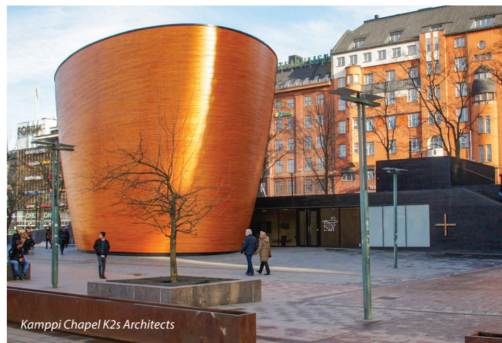
Kamppi Chapel K2s Architects

In the morning we visit two Aalto highlights, Aalto Studio (1954-55) and Aalto House (1935-36). In the afternoon we depart Helsinki by coach for Jyvaskyla.