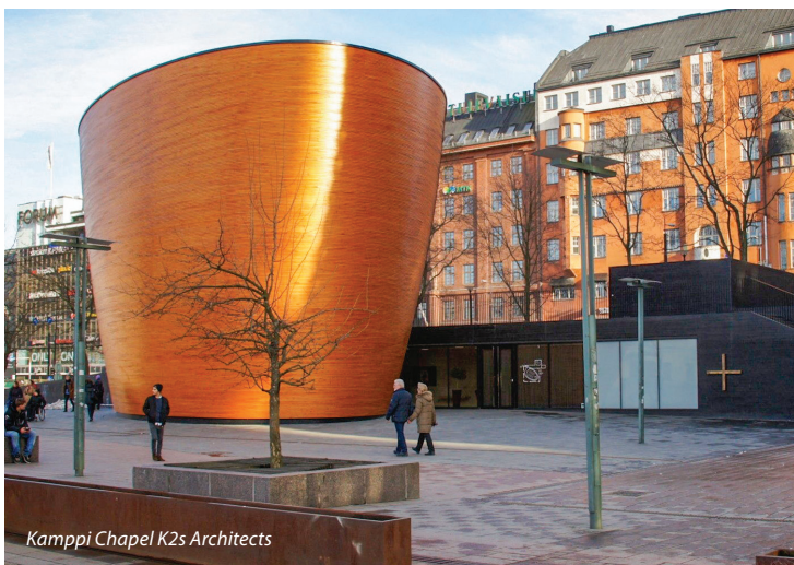
Kamppi Chapel K2s Architects

In the morning we visit Renzo Piano's 2005 Paul Klee Gallery in Bern. We then cross into France to see Le Corbusier's masterwork, the 1955 Chapelle Notre-Dame-du-Haut at Ronchamp. The first pilgrimage Chapel on this