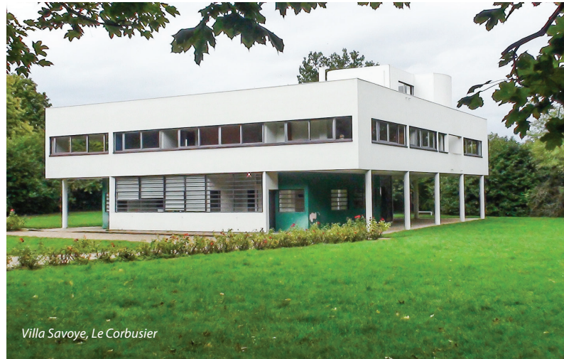
Villa Savoye, Le Corbusier

Participants should be aware that there may be minor changes to the itinerary as it is enhanced and refined prior to the tour.