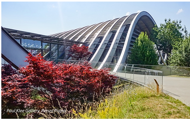
Paul Klee Gallery, Renzo Piano

hill overlooking the small town of Ronchamp was destroyed by lightning in 1913 and its replacement was then ruined by shellfire in 1944. The Chapel at Ronchamp is one of western civilization's most spiritually and emotionally intense buildings. We then travel across France by coach to visit Santiago Calatrava's stunning 1994 Lyon- Saint Exupery (previously Satolas) TGV Station. This is followed by a short trip to our hotel in Lyon.