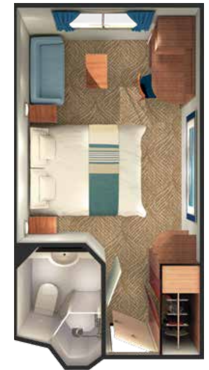
OC OCEANVIEW PICTURE WINDOW Sleeps up to three.