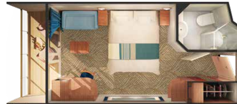
BC BALCONY Sleeps up to three.